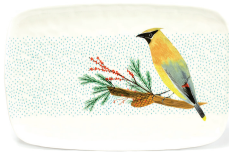
Winter Bird Platter - 16.99