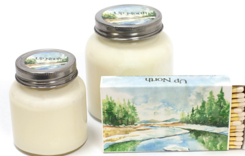
Up North Small Candle - 10.99, Large Candle - 21.99 & Matches - 5.99

We have your Wisconsin sports ornaments covered! Check out our wide variety in stores today!