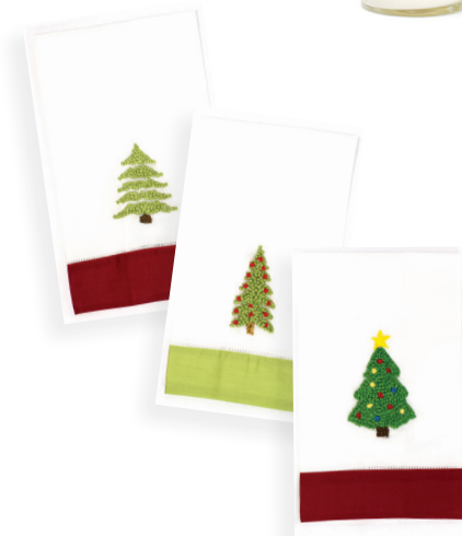
Linen Towels with Trees - 11.99