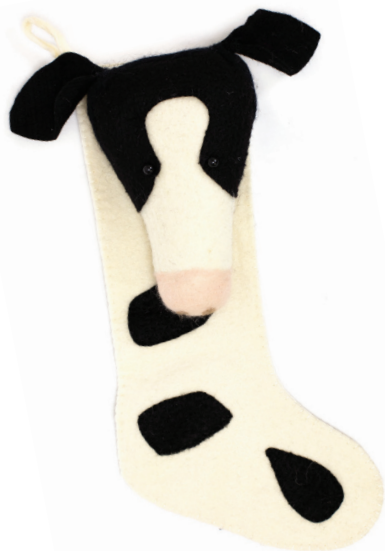
Felted Wool Cow Stocking - 27.99

Home for the holidays and it feels so good. Grab these perfect gifts that will never leave you homesick.