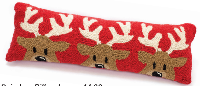
Reindeer Pillow Long - 44.99