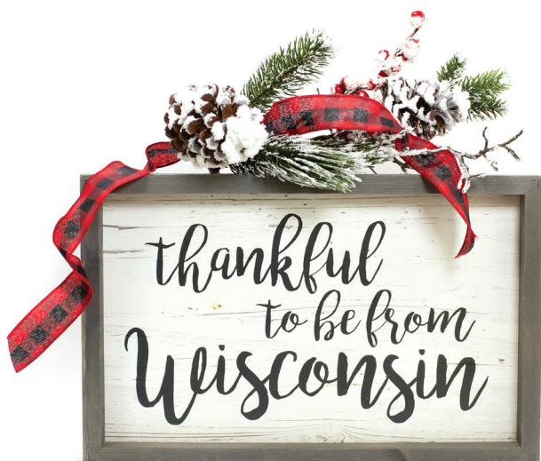
Thankful to be from Wisconsin Picture - 31.99