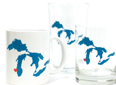
Great Lakes Mug - 6.99, Pint Glass - 8.99 & Old Fashioned Glass - 9.99