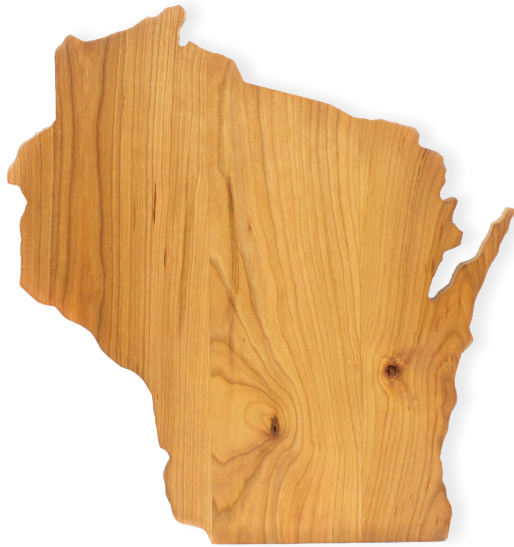
Wisconsin Cutting Board - 20.99