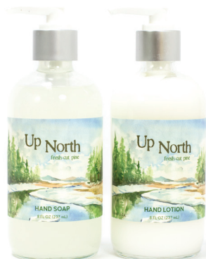
Up North Soap & Lotion - 16.99 ea