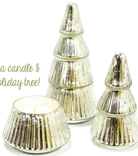
Christmas Tree Candle - 21.99