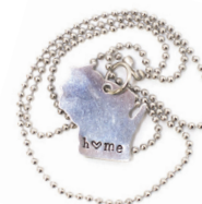
Wisconsin Home Necklace - 14.99