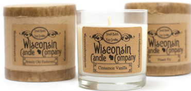
Wisconsin Candle Company Candles - 19.99