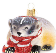
Wisconsin Badger Ornament - 14.99

We have your Wisconsin sports ornaments covered! Check out our wide variety in stores today!