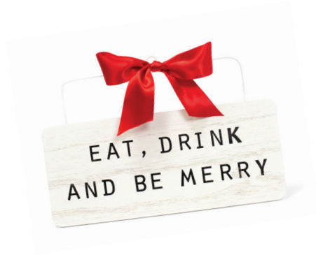
Eat, Drink & Be Merry Sign - 10.99 ea