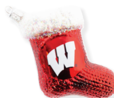
Wisconsin Badger Stocking Ornament - 14.99