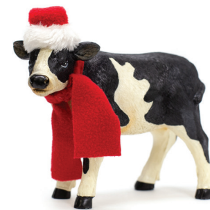
Holiday Cow Figurine - 16.99