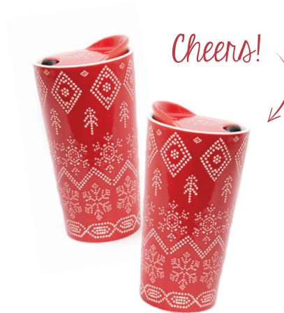
Snowflake Travel Mug - 19.99 ea