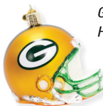
Green Bay Packers Helmet Ornament - 19.99