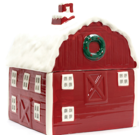
Ceramic Barn Cookie Jar - 44.99